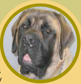
Logan, one of our therapy dogs