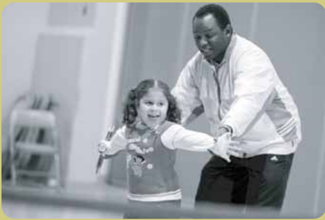
Healthy living is a focus in all our programs: We teach and model physical fitness of every kind as well as healthy eating.